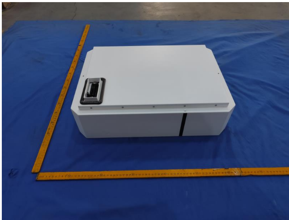
样品图片 (Sample photograph) -2