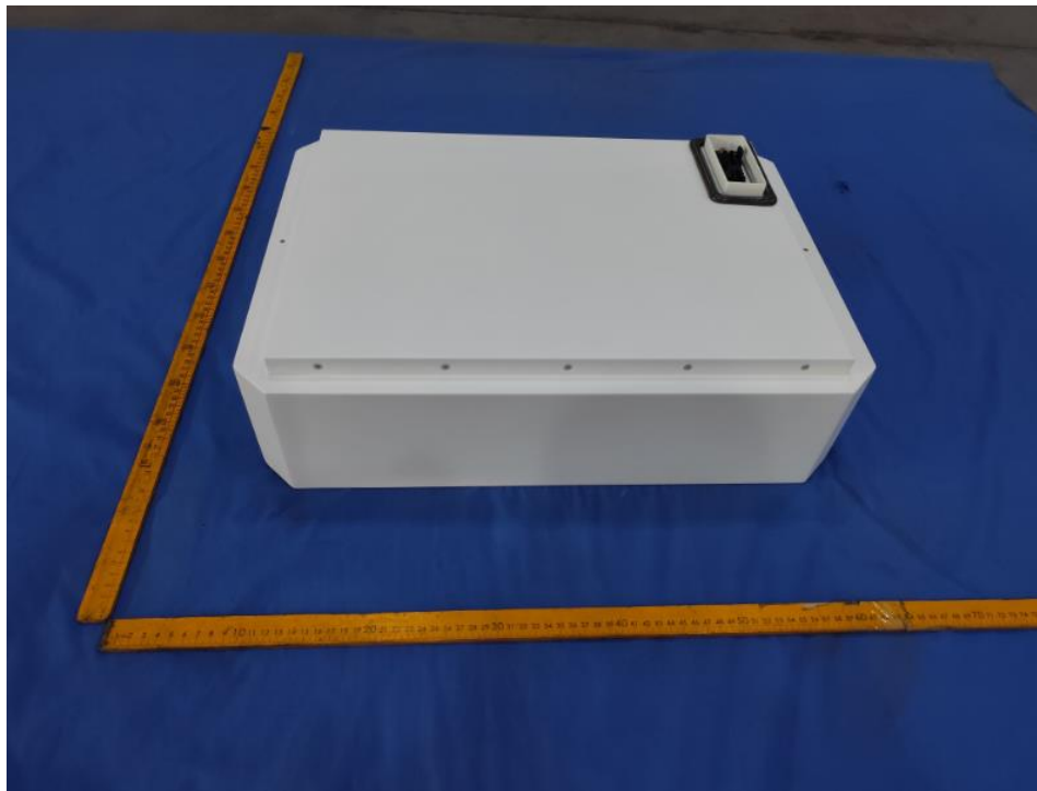
样品图片 (Sample photograph) -4