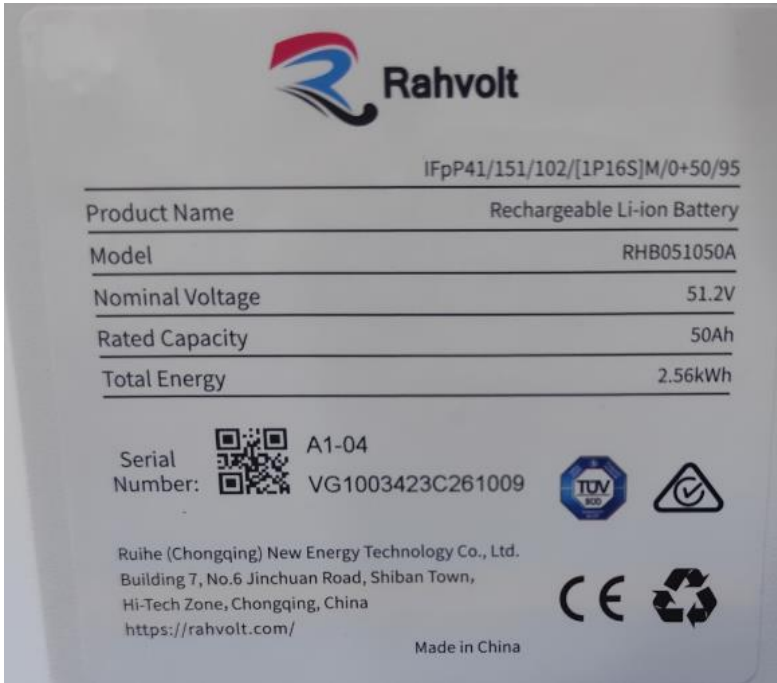
样品图片 (Sample photograph) -8