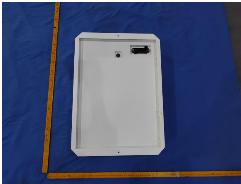
样品图片 (Sample photograph) -6